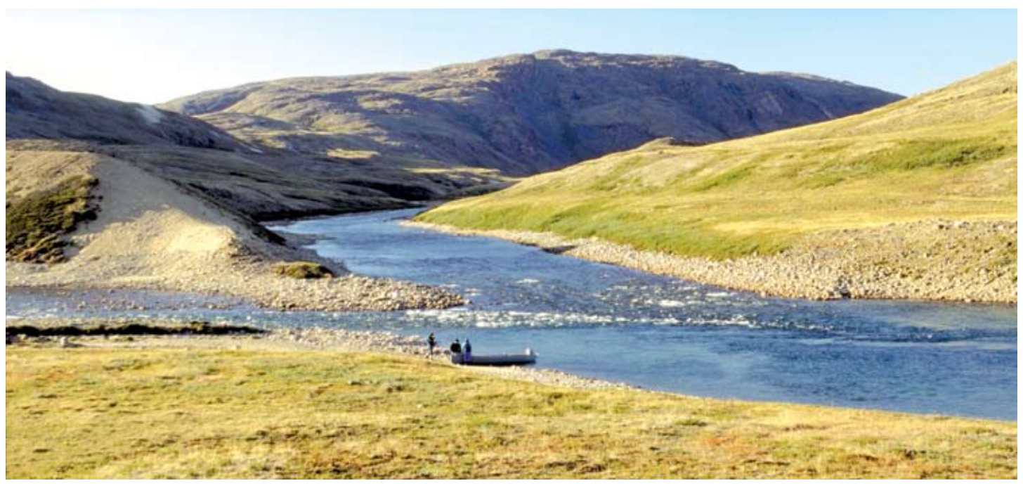
Nunavut Parks & Special Places - Editorial Series