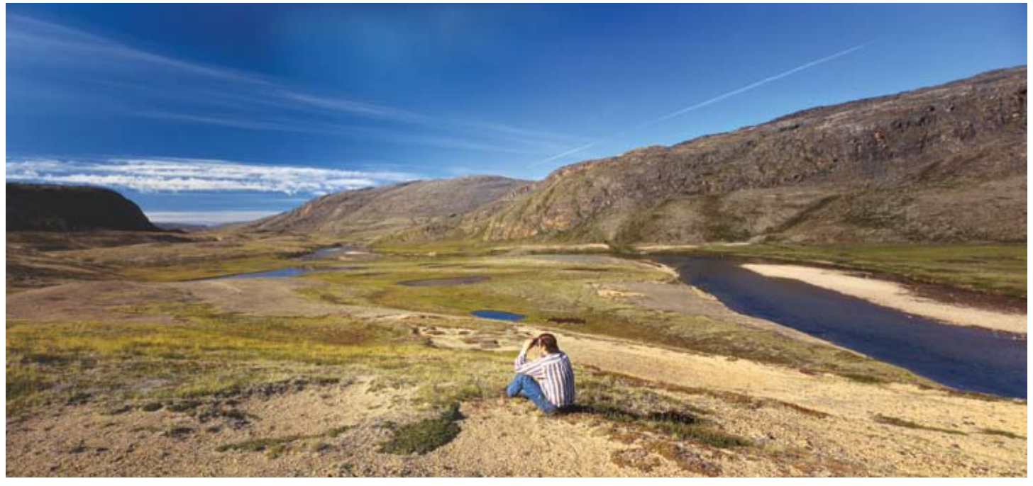
Nunavut Parks & Special Places - Editorial Series