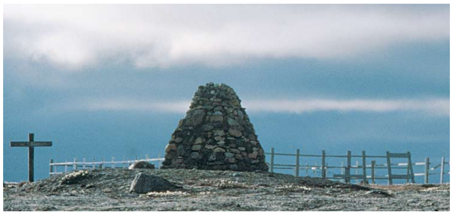
Nunavut Parks & Special Places - Editorial Series