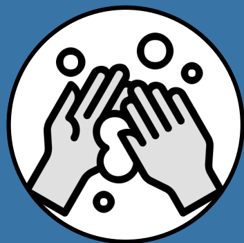
ᓂᓄᓂᑦ ᓂᓄᓂᑦ ᓂᓄᓂᑦ ᓂᓄᓂᑦ