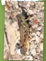
The Migratory Grasshopper ( Meianoplus sanguinipes ) is a winged insect that is widely distributed across Canada and is one example of a species that may expand its range into Nunavut.

Wildlife movements are often referred to as "range extensions" where a species expands the area they can live in when the habitat and climate is favorable for them.