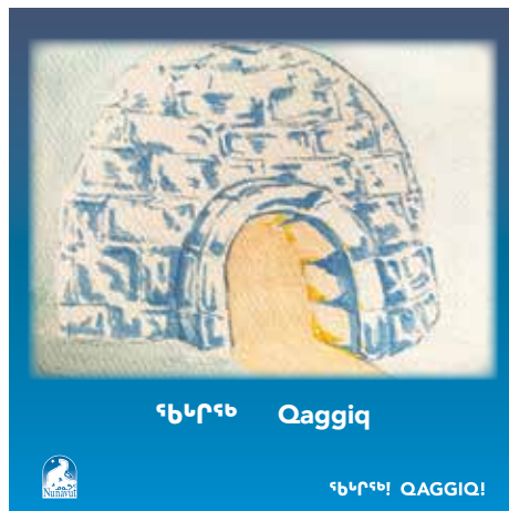
ᐱᑭᑭᑭᑦ ᐱᑭᑭᑭᑦᐅᑦᐅᑭᑭᑦ ᐱᑭᑭᑭᑦᐅᑦᐅᑭᑭᑦ ᐱᑭᑭᑭᑦᐅᑦᐅᑭᑭᑦ ᐱᑭᑭᑭᑦᐅᑦᐅᑭᑭᑦ ᐱᑭᑭᑭᑦᐅᑦᐅᑭᑭᑦ.

ᐱᑭᑭᑭᑦᐅᑦᐅᑭᑭᑦ ᐱᑭᑭᑭᑦᐅᑦᐅᑭᑭᑦ ᐱᑭᑭᑭᑦᐅᑦᐅᑭᑭᑦ ᐱᑭᑭᑭᑦᐅᑦᐅᑭᑭᑦ ᐱᑭᑭᑭᑦᐅᑦᐅᑭᑭᑦ ᐱᑭᑭᑭᑦᐅᑦᐅᑭᑭᑦ.