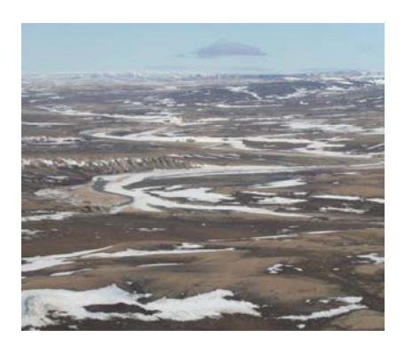
Figure 1: Study area and flight track from June 03 to June 12, 2006.