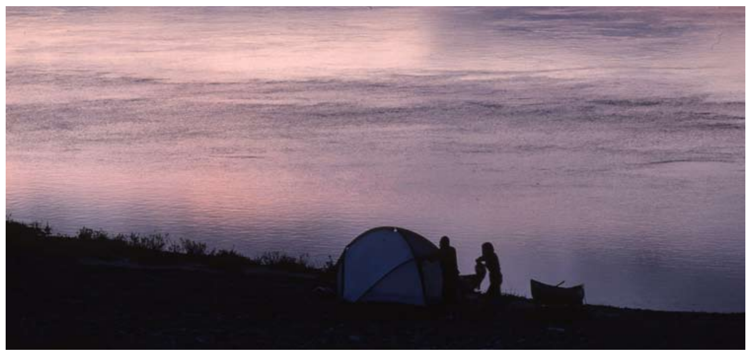
Nunavut Parks & Special Places - Editorial Series