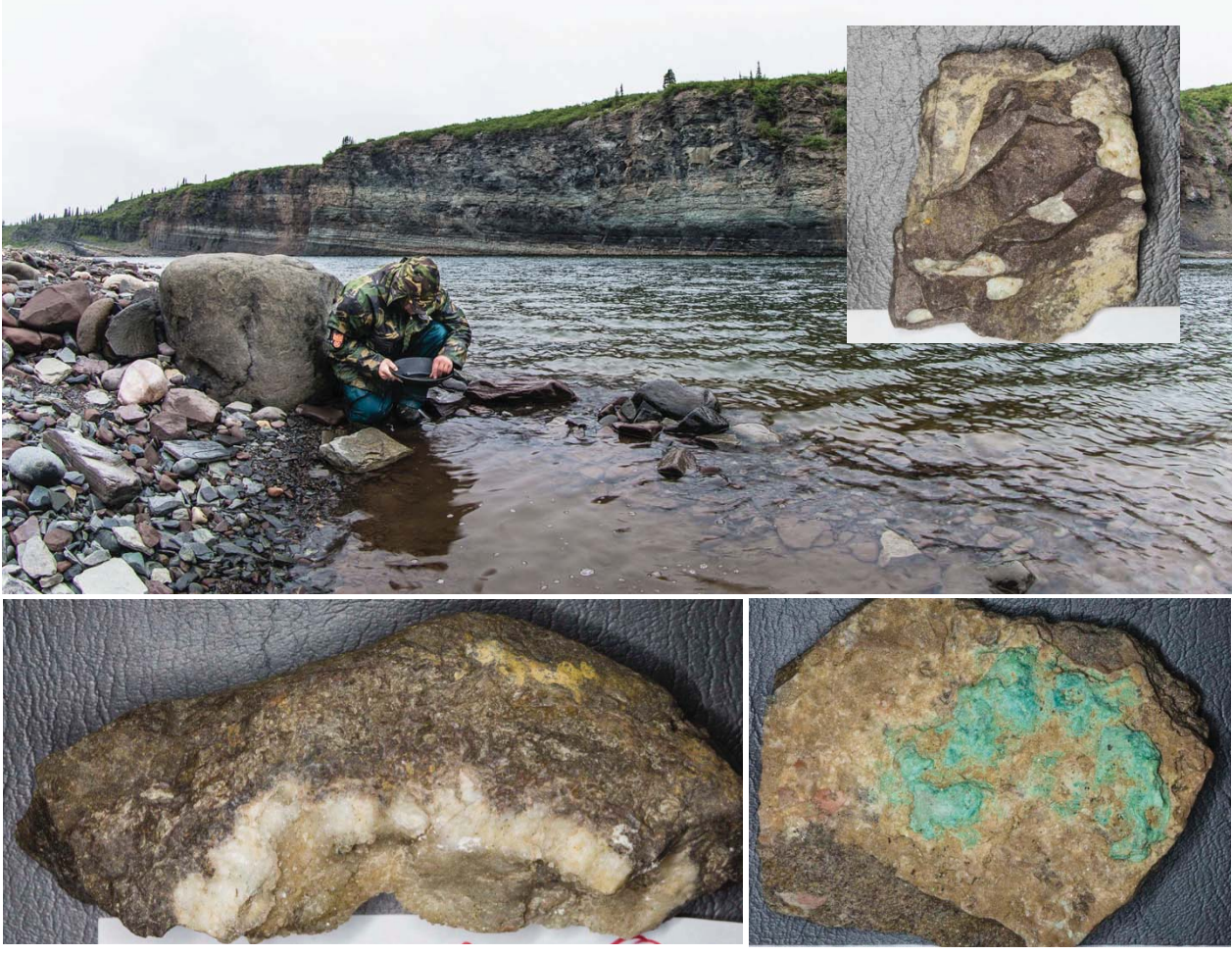
Figure 4: Panning on the Coppermine River and some of the samples collected.

Because the navigation through rapids and shallows was quite challenging, we did not stop as much as we had planned. I will need to plan future expeditions to examine a smaller area for a longer period of time. We, nevertheless, collected a number of interesting samples.