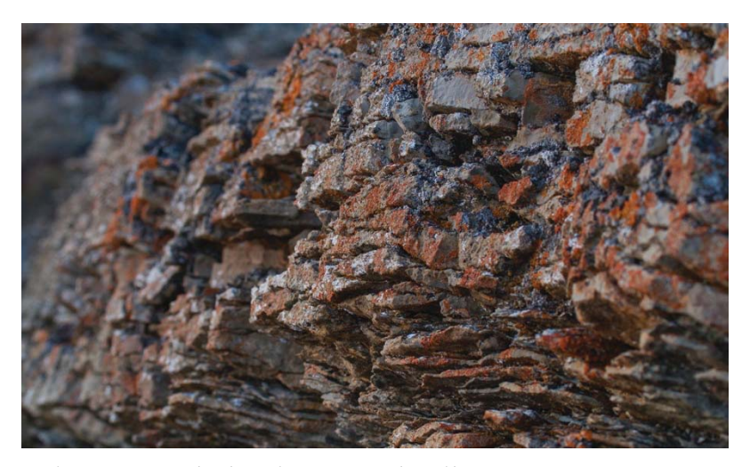
Figure 7: Rock showing near Ulurvik.

I wanted to check some of the rocks showing west of Ulurvik. I reached Ulurvik by boat and went by ATV to inspect some of the showings I had noticed before. I didn't really find anything of interest.