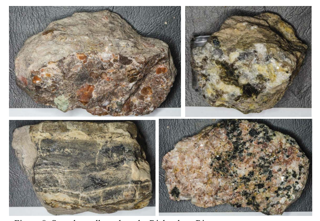
Figure 8: Samples collected up the Richardson River.

I decided to investigate the Richardson River in preparation of next year. The Richardson River is also accessible for a longue stretch by jet boat and there used to be a little bit of exploration a while back in that area. My partner and I did a day trip up the river and I collected some samples (Figure 8) to get an idea whether it was worth planning an expedition next year.