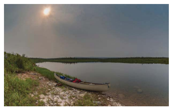
Figure 2: Exploring Kendall River

July 27: We started our way back down the Coppermine River by jet boat. We stopped at 4 sites to examine rocks and gravels. We panned and collected samples (Fig 4 a, b, c, d).