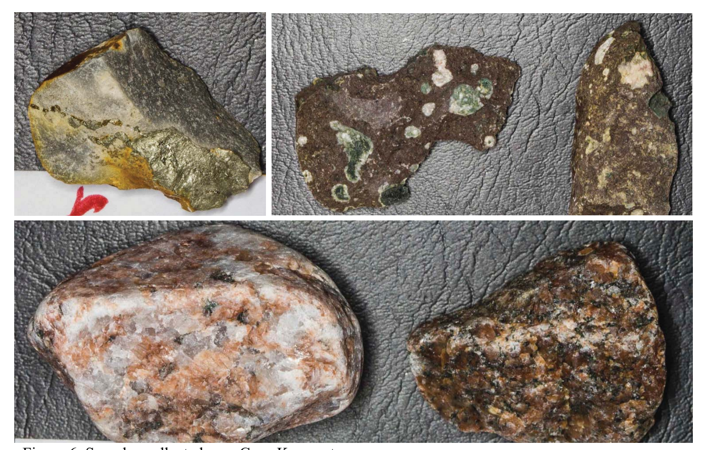
Figure 6: Samples collected near Cape Krusenstern.